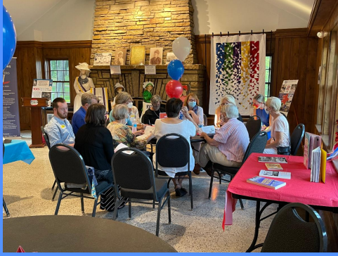
The evening's new member reception was a success.