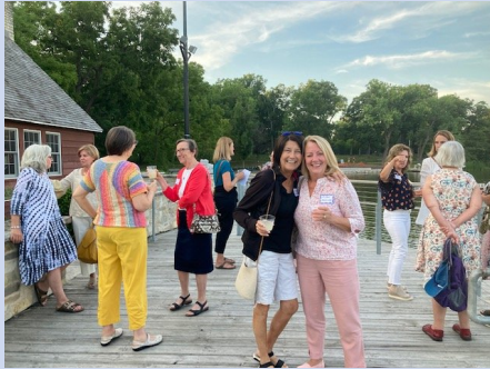
It was a beautiful night at the boathouse to Celebrate League