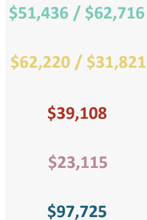
DUPAGE COUNTY ANNUAL WAGE [2]